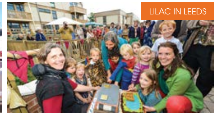
LILAC IN LEEDS

Almost all CLTs and cohousing groups have been established as group-led schemes. Other innovative CLH schemes developed in this way are LILAC in Leeds and Ashley Vale in Bristol.