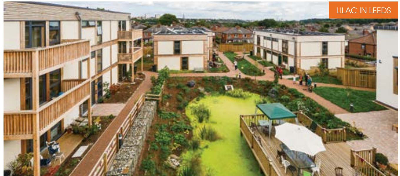
LILAC IN LEEDS

Often comprised of local volunteers, the group will usually require technical assistance and support to set up and develop their project. Help and advice is available from national CLH support organisations and, where available, a local CLH enabler, who support the group throughout the process, broker partnerships and provide assistance on matters including financial, legal and planning issues, project and risk management, and partnerships.