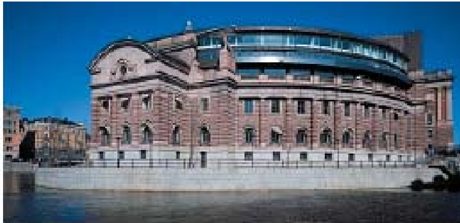
The House of Parliament in Stockholm.